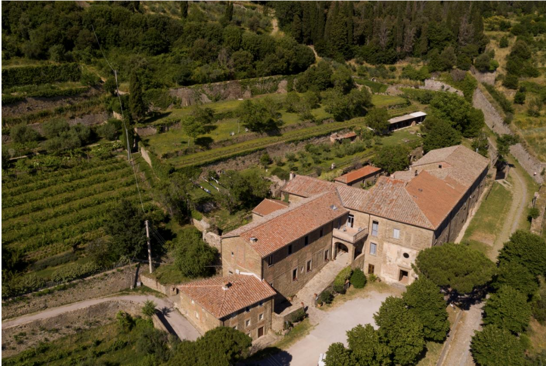
University of Georgia : Cortona, Italy Center