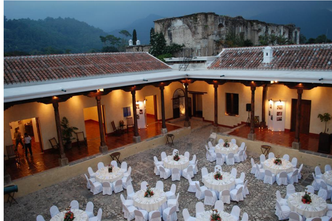
University of Texas : Antigua, Guatemala