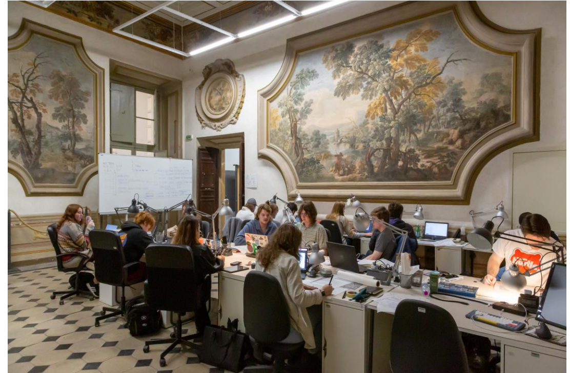
University of Arkansas: Rome Center