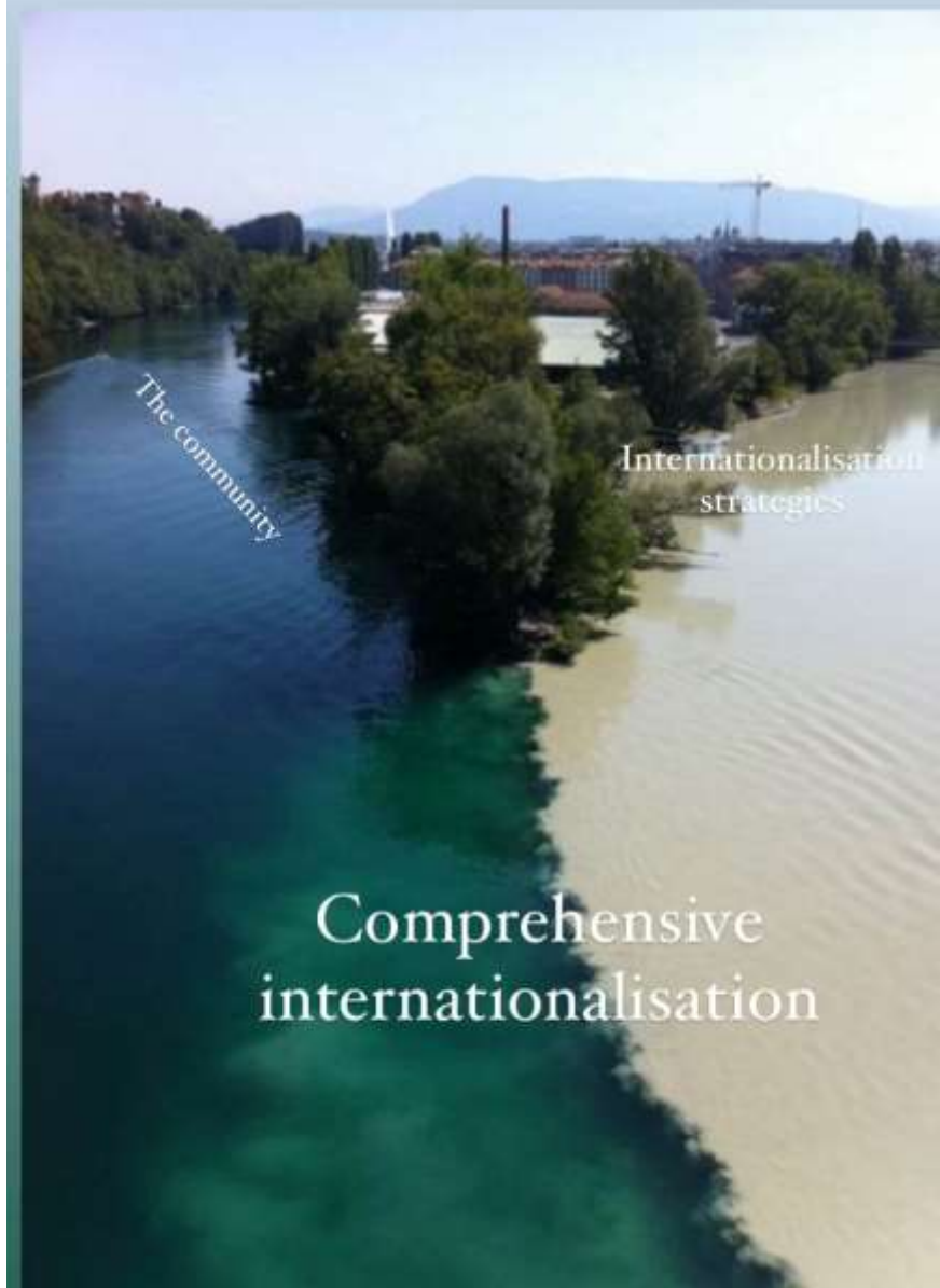
Figure 1: Convergence between the community and Internationalisation Strategies to produce comprehensive and inclusive internationalisation